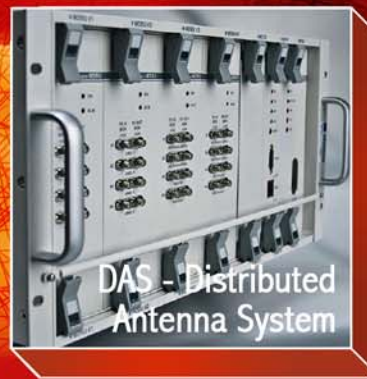
DAS - Distributed Antenna System