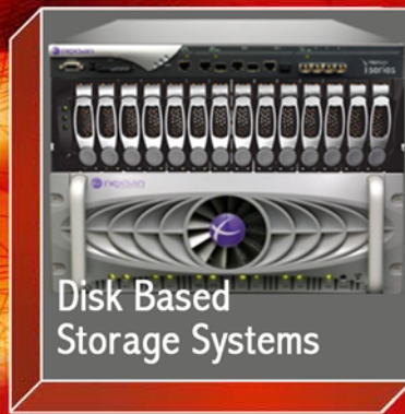
Disk Based Storage Systems

Quality care through innovative technology . . . IgeaCare